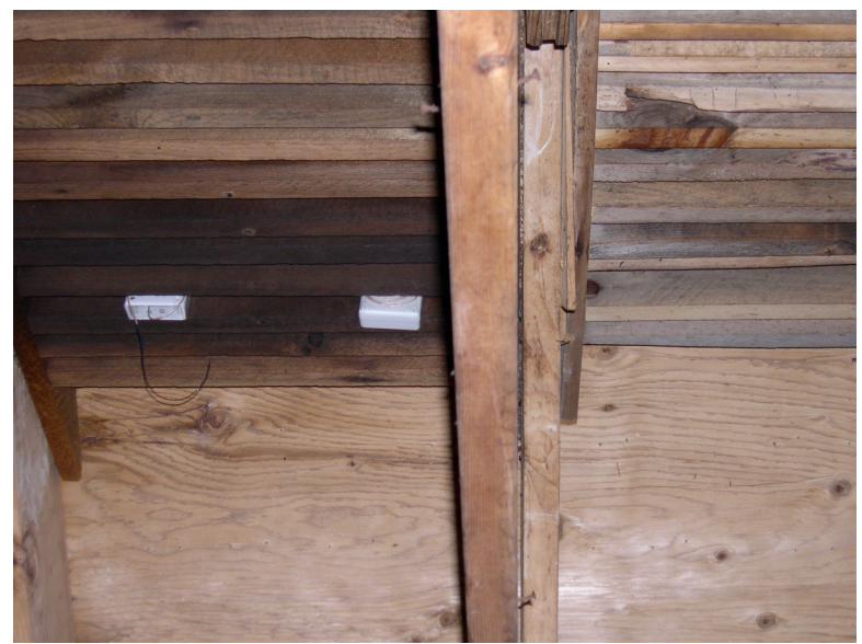
Mica2 Motes in Barn, Paxton, Mass