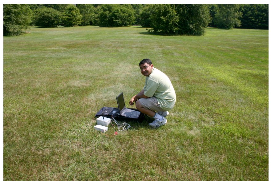
Base Station Setup, Sargent Camp