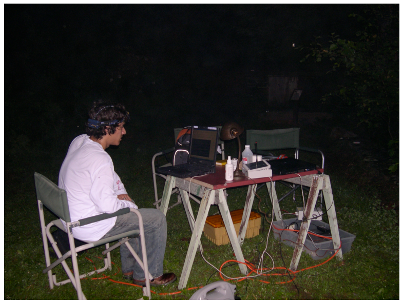
Data Collection in Bat Habitat, Paxton Mass