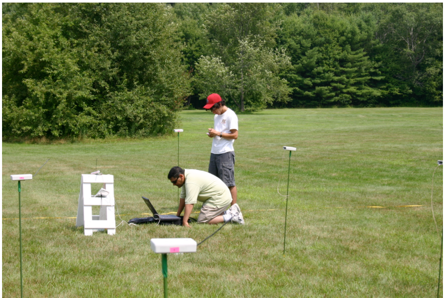
Sensor Array, Sargent Camp