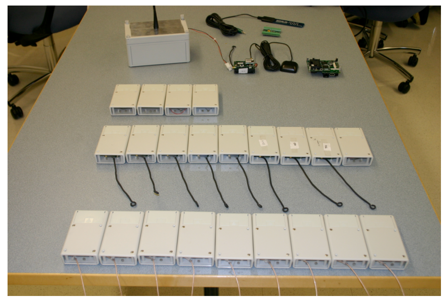
Mica2 Mote and Stargate Weather Packaging